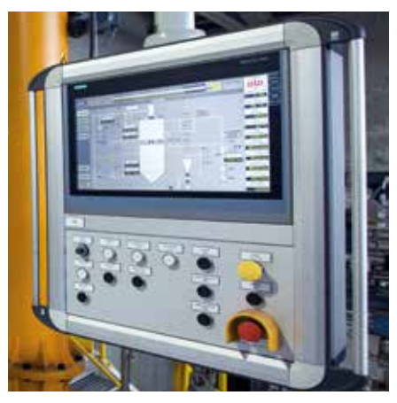
Process control ensures constant and reproducible quality.