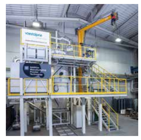
Our test facility enables us to stay one step ahead in research and development.